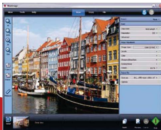
The easy-to-navigate Nextimage interface